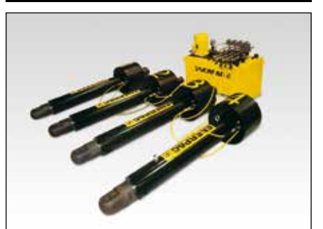
SHS-SERIES, SYNCHOIST – HIGH PRECISION LOAD POSITIONING SYSTEMS Accurate hoisting and load positioning system t

Accurate hoisting and load positioning system to enhance a crane's capability.