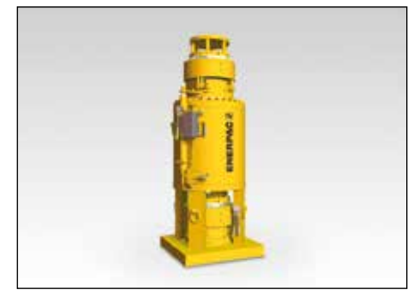
HSL-SERIES, STRAND JACKS Compact high capacity system for controlled lifting and lowering. Strand jack systems that provide fully controlled precise lifting.