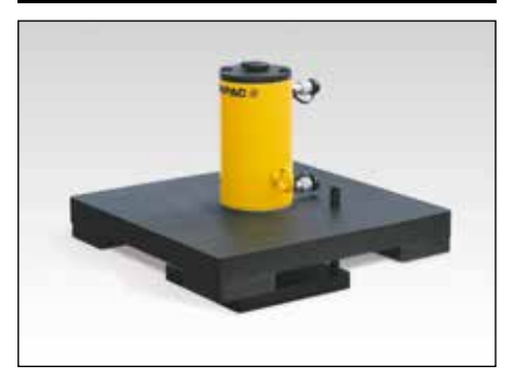
BLS-SERIES, CLIMBING JACKS

Double-acting stage lift cylinders with solid plunger design allows for a load to be lifted many times the stroke of the cylinder. The solution for incremental lifting.