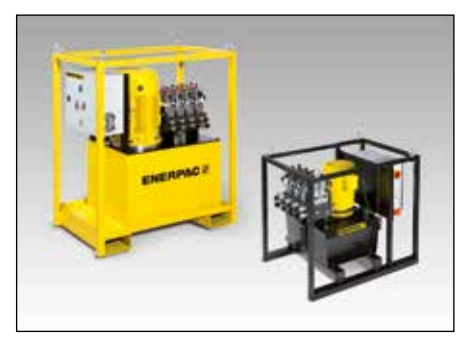
SFP-SERIES, SPLIT FLOW PUMPS

The split flow pump is an economical solution for multi-point controlled lifting applications. Multiple outlets with equal oil flow.