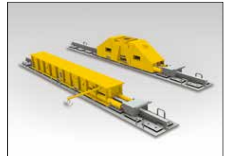
HSK, HSKLH-SERIES, SKIDDING SYSTEMS A system comprised of a series of skid-shoes powered by hydraulic push-pull cylinders, traveling over a pre-constructed track.