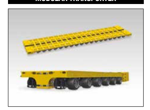
SPMT-SERIES, SELF-PROPELLED MODULAR TRANSPORTER A trailor with a clim decign to transport large of

A trailer with a slim design to transport large and heavy objects. Hydraulic strength in a linear drive transport system.