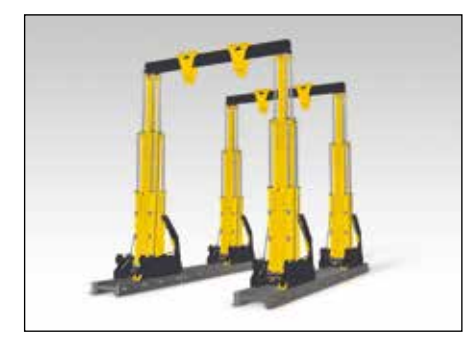
SL, SBL, MBL-SERIES, HYDRAULIC GANTRIES Heavy lifting systems that offer control and stability, even in confined spaces. For your most demanding lifting and rigging operations,